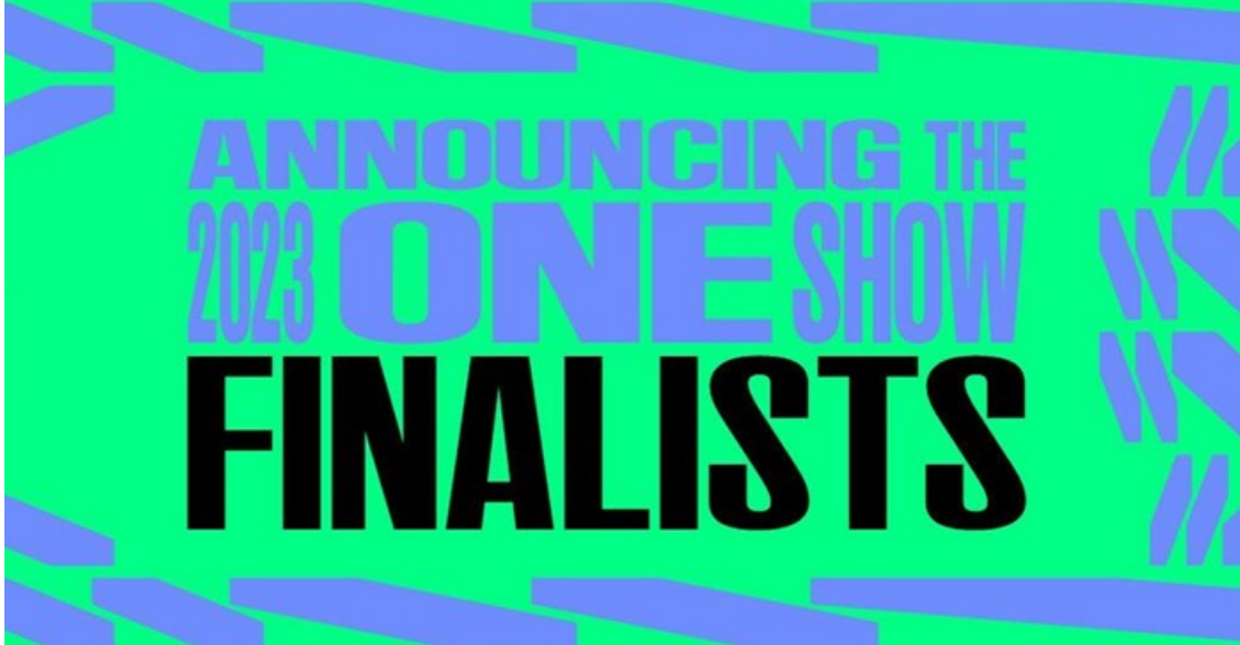
Image supplied. The One Show 2023 finalist list has been revealed with close to four dozen countries and regions on the list, including South Africa and Africa

The One Show 2023 finalist list has been revealed with close to four dozen countries and regions on the list, including South Africa, with local agencies Ogilvy SA, FCB, VMLY&R, Grey Advertising, M&C Saatchi Abel, Grid Worldwide, Promise, Accenture Song with Blackboard and Carat as well as Romance Films all represented.