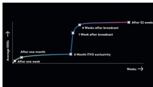
VOD premiere with viewing build across linear