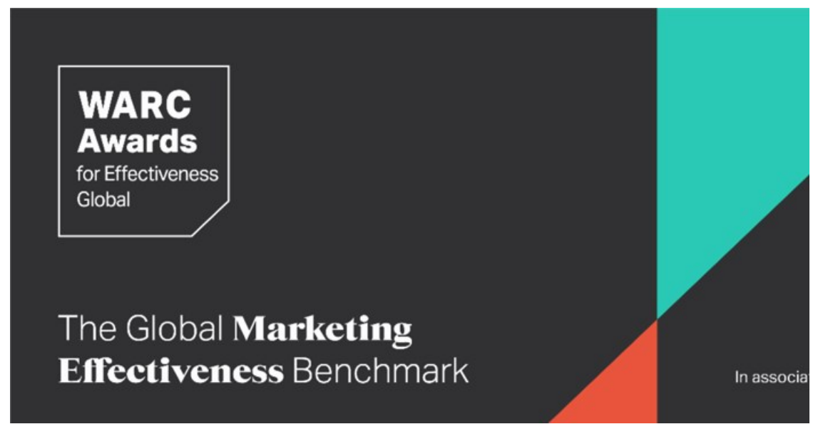
The Warc Awards for Effectiveness 2023, in association with Lions, have been announced

The Warc Awards for Effectiveness 2023, in association with Lions, have been announced, with a total of 113 campaigns for 31 markets shortlisted across 11 categories including Africa (Nigeria, Kenya and Egypt) shortlisted five times and the Middle East Region shortlisted nine times.