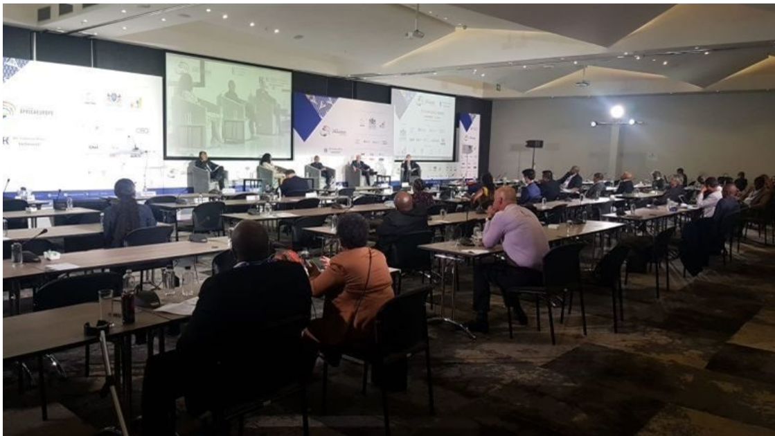
CEOs turned up and socially distanced in Sandton for the South African Europe CEO dialogue, courtesy of the European House Ambrosetti

“Business confidence has increased significantly. We have just hosted the South African Investment Conference and raised over R110bn in pledges. The investment climate requires the government to become an active participant in eliminating barriers to trade. Even in the midst of the Covid-19 pandemic, only 10% of projects previously committed to at previous investment conferences are under strain and 90% of the value of the investments are still being made and in the implementation phase, which is encouraging. We need to reboot the economy and the recovery will be infrastructure led, which is what makes collaborations such as the Southern Africa Europe CEO Dialogue so important,” said Makhaya.