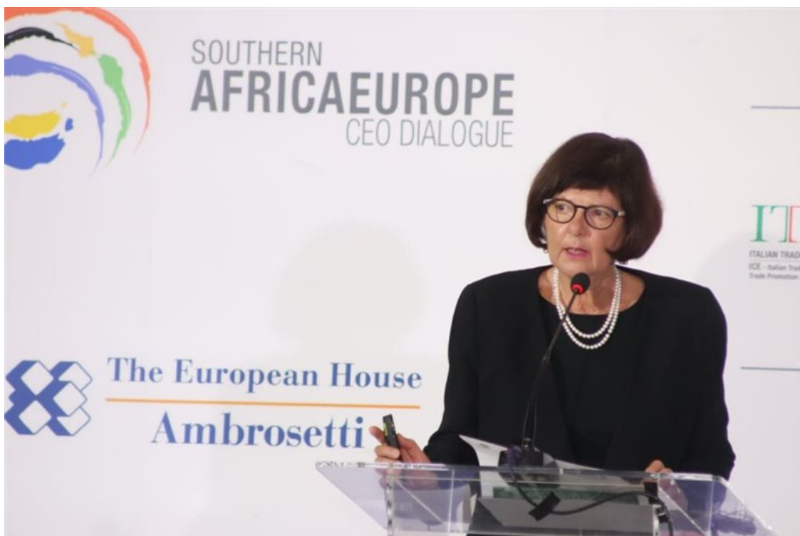
Minister of Forestry, Fisheries and Environment Barbara Creecy delivered a presentation on climate change and South African's plans for the future.

“Even in the face of Covid-19, we have been hard at work in partnership with the private sector, national government and municipalities to unlock investments in high-growth sectors of the Gauteng economy,” Premier Makhura added.