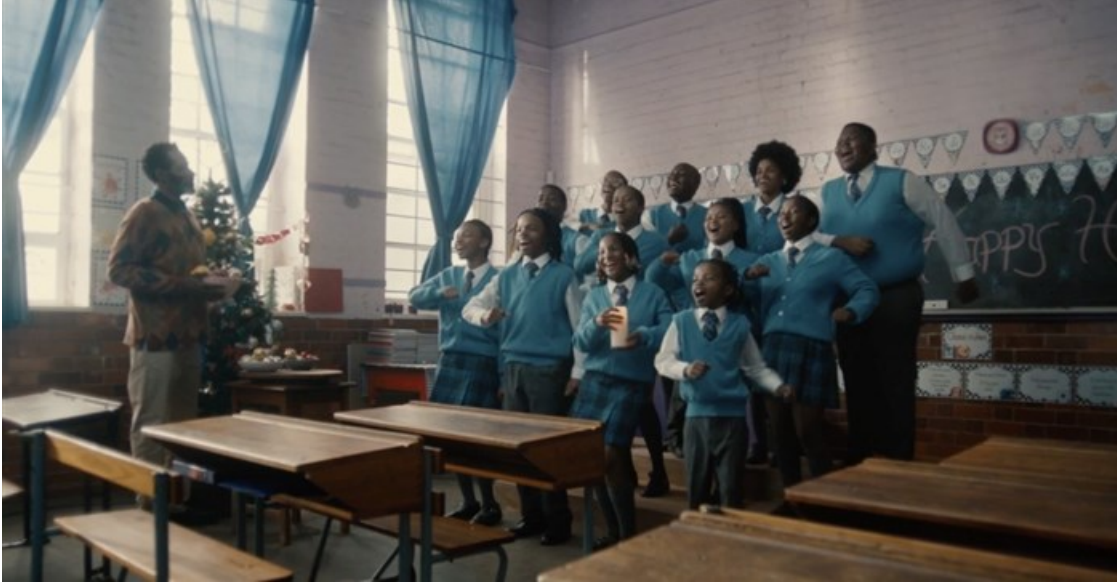
Image supplied. The South African kids choir are featured in Disney's first live-action festive ad, A Wish For The Holidays , which was fully shot in Cape Town

Disney's first live-action festive ad, A Wish For The Holidays , was fully shot in Cape Town, South Africa and features singing by the South African kids' choir.