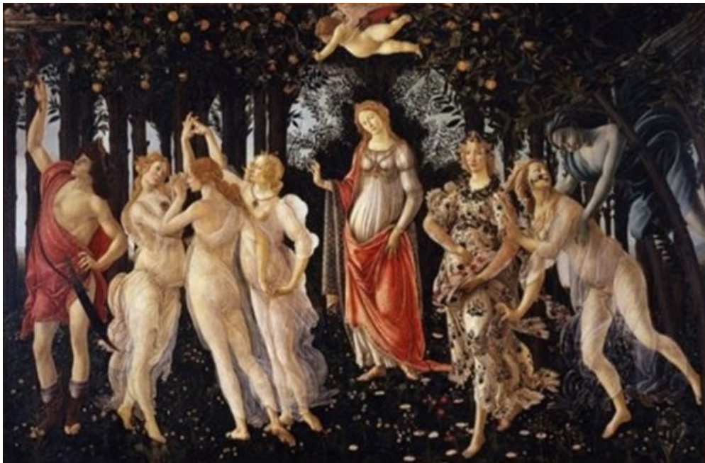
A period of revival

In part two, we look at three ways consumers are likely to respond as we come out of lockdown and the role of our brands in meeting their needs and as Grace put it, achieving that really simple objective that marketing sets out to achieve and that is to get consumers to choose you over your competitors. At the end of discussing each of these responses, they posed a question that they believe marketers and agencies should get together and discuss and debate and get to a very precise answer.