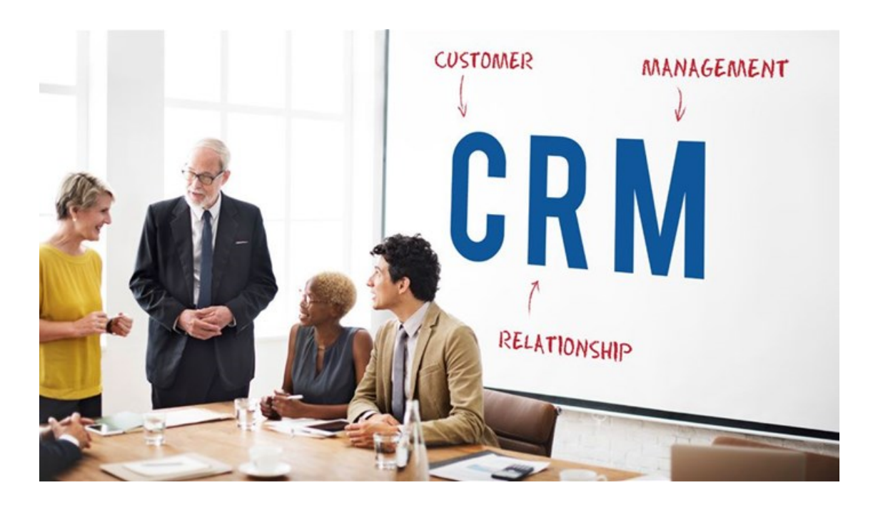
First, Let's understand the sales processes and sales velocities in manufacturing and printing

The sales journey in manufacturing and printing can vary drastically. On one end, you have high-velocity transactional sales — a sprint that takes you from enquiry to quote in the blink of an eye, perfect for simpler, standardised products. On the other, you embark on a marathon, navigating through stages of enquiry, contact, qualification, meetings, demos, and quotes. This slower velocity sales process is a dance of patience and precision, commonly associated with bespoke, high-value products that necessitate a consultative selling approach.