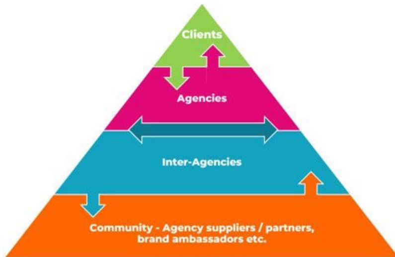
Channel Partnership Pyramid of Value Creation

Corporate marketing ecosystems are complex. Large internal teams spanning brand, digital, trade and public relations (the list goes on!) are supported by a network of supplier marketing agencies - who all, in turn, have their own networks of partners and suppliers (collectively this is "the channel").