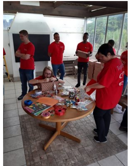
The PE team working on their personalised boxes for the Santa Shoebox Project