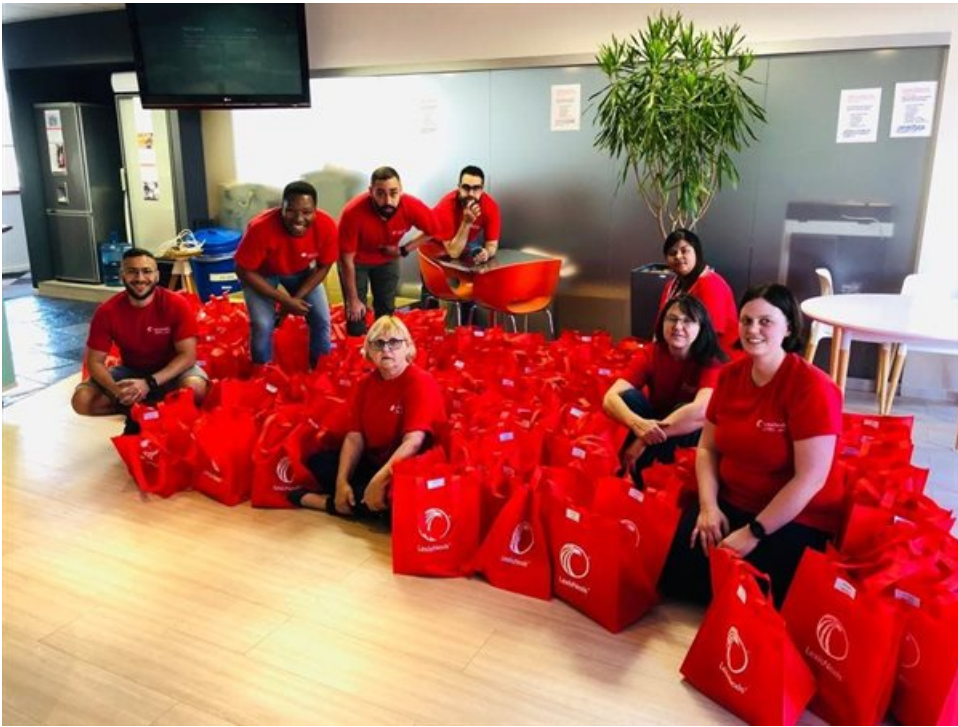
The Cape Town team packed comfort packs for the Rape Crisis Cape Town Trust

“In South Africa employees in five cities volunteered their time and skills throughout October to give back to our communities in a number of different ways. Our employees care deeply about adhering to the highest standards of behaviour and working collaboratively to improve the lives of others in our surrounding communities.”