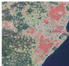
Heat map with Suburb Layer