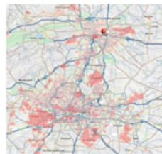
Population Density Heat map