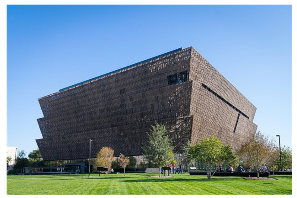
David Adjaye's Smithsonian National Museum of African American History and Culture in Washington DC.

Both structures have added nuanced cultural expression to their respective cities, and both highlight that, given the diversity and cultural depth within Africa, there can be no single definition of African architecture. What African countries do share, however, is a colonial history, a struggle to emerge from that yoke and a desire to assert themselves.