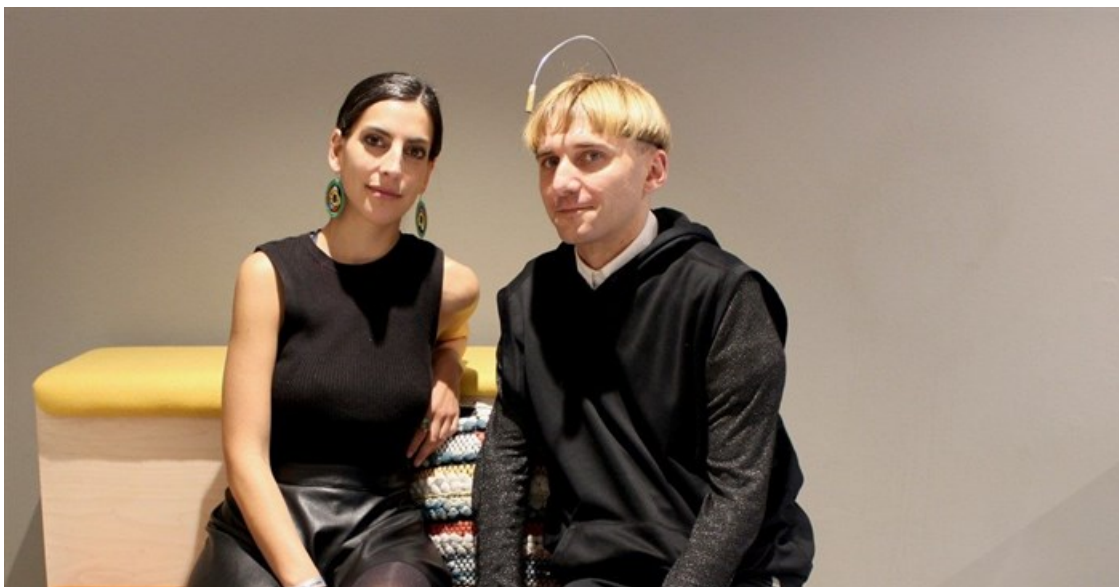
Moon Ribas, a Spanish avant-garde artist with Neil Harbisson, a cyborg artist.

His counterpart on the stage today, Barcelona-born Moon Ribas, demonstrated how having sensor implants in her feet, allows her to hear earth's seismic activity which she expresses creatively through choreography. Millennials!