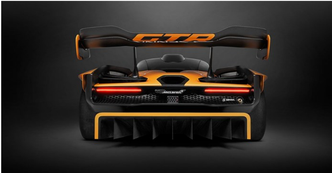
McLaren Senna GTR Concept

The McLaren Senna GTR Concept produces more power and torque than the road-legal McLaren Senna, and achieves the quickest McLaren lap times outside Formula 1.