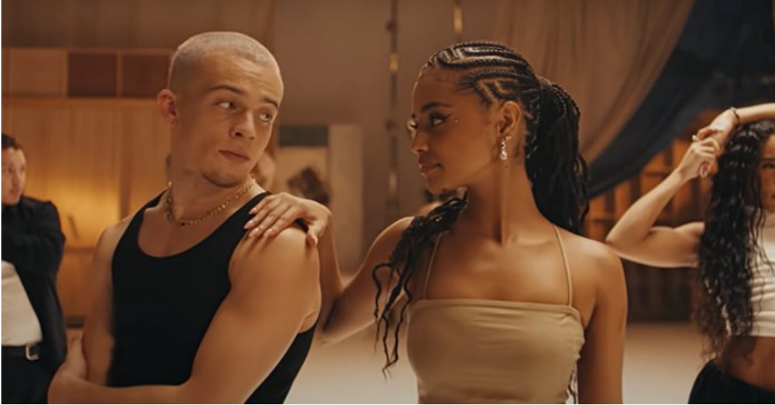
Tyla stars in a Gap commercial.

South African musician Tyla has put the country on the map with her authenticity and unique sound, making waves in the Western music scene.