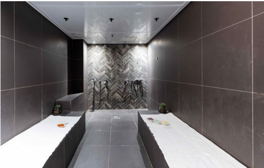
Mineral Mist Rasul.

This is followed by a mineral mist rasul, where you cover yourself with a body mask in the heated rasul room and surrender to the soothing sensations as the body mask infuses your skin with essential nutrients.