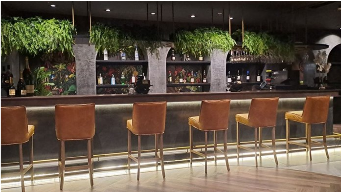
Grotto Spa Bar.

From the Obsidian Prelude lounge, Grotto Spa bar, serenity nests, a reflection heated hydrotherapy pool, a polar plunge pool, and hand and foot oasis to the steam retreat, sauna oasis and mineral mist rasul, the interior is certainly something out of this world.