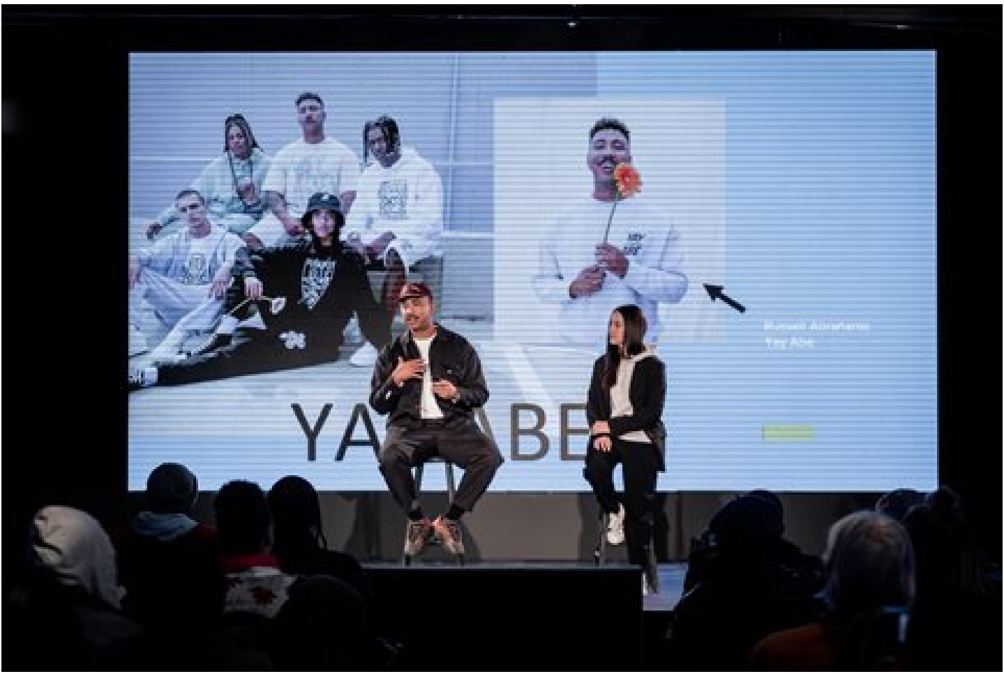
The SoCreative Summit is a free event, fostering inclusivity and accessibility. Those interested in attending can register at <a href="https://socreativesummit.com">https://socreativesummit.com</a> to secure their spot. For those unable to attend in person, a live stream of the mainstage