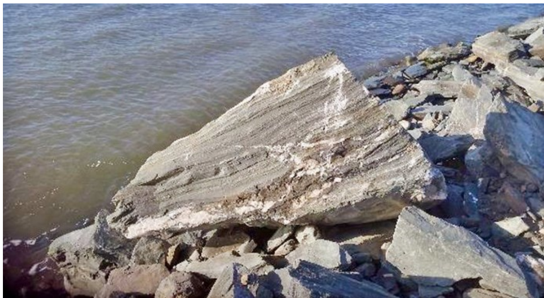
Rocks on the coffer dam wall.

The mining company has now turned to the courts with a review application under the Promotion of Administrative Justice Act (Paja) to overturn Creecy’s decision.