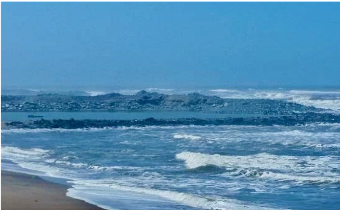
Coffer dam wall at low tide.

DFFE has also laid criminal charges against Alexkor for its use of coffer-dams.