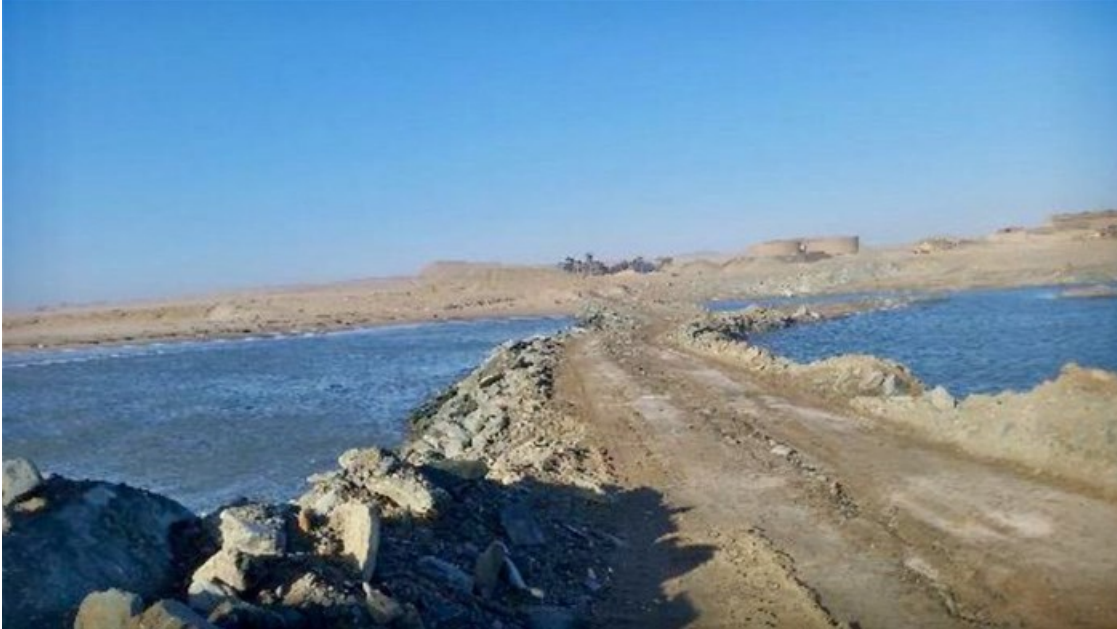
The Alexkor coffer-dam wall between two dams at high tide.

The state mining company is challenging an environmental compliance notice.