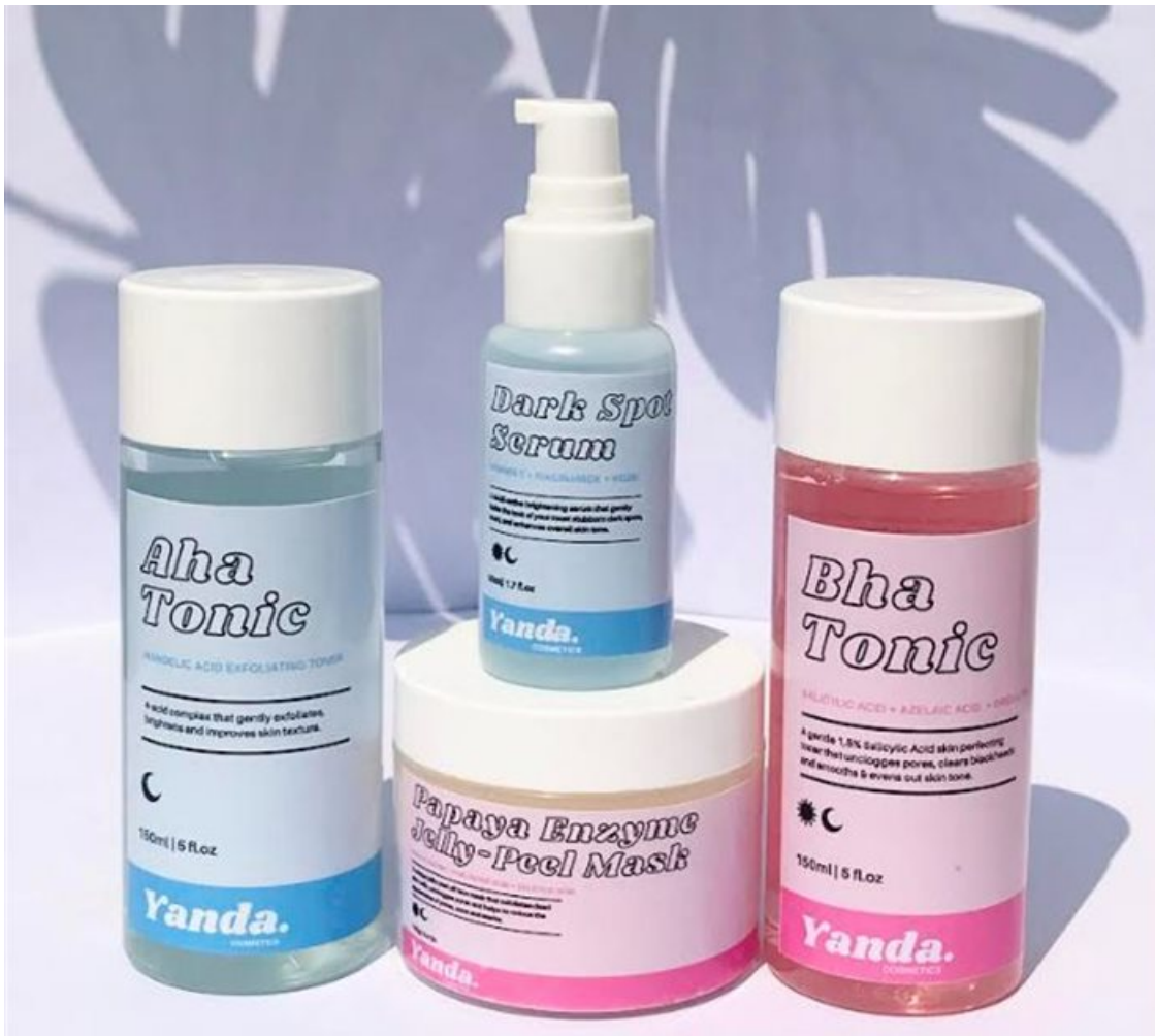
Yanda Cosmetics skincare.